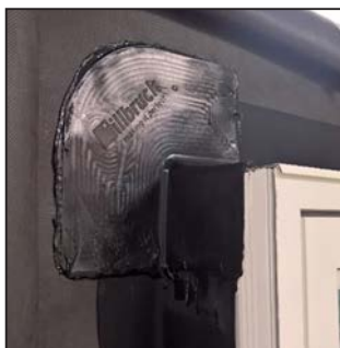
Fig 1: ME241 EPDM Corner, shown bonded after ME220 VV application (bond with OT015)

Safety data sheet must be read and understood before use.