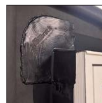
Fig 2. ME241 Corner bonded